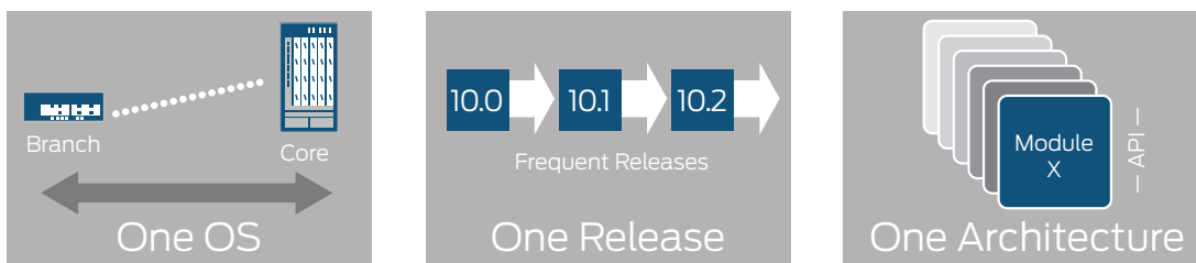
Junos OS uses a single source code, adheres to a consistent and predictable release train, and employs a single modular architecture.