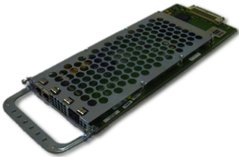
Figure 3 Cisco AS5350 Two-, Four-, or Eight-Port Termination Feature Card

The following is a brief description of the trunk types supported: