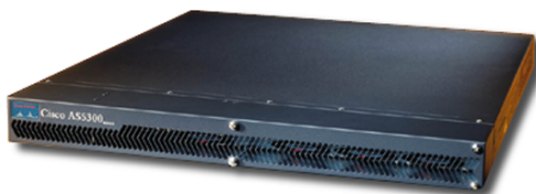
Figure 1 Cisco AS5350 Universal Gateway

The Cisco AS5350 comes with two 10/100 autosensing Ethernet ports, which are ideal for redundancy and firewall applications. Additionally, two high-speed serial ports are provided to support Frame Relay, Point-to-Point Protocol (PPP), and High-Level Data Link Control (HDLC) backhaul. All backhaul interfaces support Hot Standby Router Protocol (HSRP), and all cards and the fan tray are hot-swappable