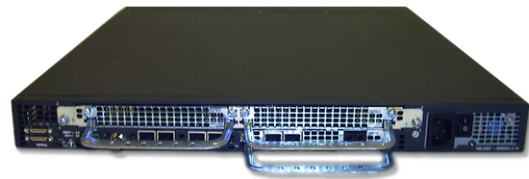
Figure 2 Cisco AS5350 Chassis View

The Cisco AS5350 Universal Gateway provides all the system components that service providers have come to expect from carrier-class products as well as all the routing, WAN, and QoS features that are the hallmark of Cisco routing products. The Cisco AS5350 uses a 250-MHz RISC microprocessor with 256K secondary and 2-MB tertiary caching. The main CPU in the Cisco AS5350 is also used in the Cisco 7200 Series Network Processing Engine 300. The Cisco AS5350 offers the option of a redundant power supply or single power supply. The Cisco AS5350 has three slots that can contain trunk and universal port feature cards. The Cisco AS5350 architecture uses distributed processing between the feature cards and the motherboard to optimize the processing path for unparalleled performance (See Figure 2).