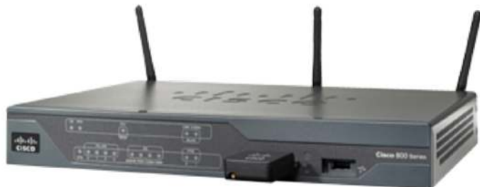
Figure 1. Cisco 880G Series 3G Wireless Integrated Services Routers

With enhanced data rates and improved latency (below 100 milliseconds), WWAN services are an ideal way to supplement traditional wire line services. 3G WWAN data services offered today have average data rates well in excess of ISDN speeds, with theoretical limits in excess of 7 Mbps on the downlink and 5 Mbps on the uplink. The 3G WWAN can be use as a primary link for sites with lower bandwidth requirements and for mobile applications. The 3G WWAN data services can also be use as a cost-effective alternative in areas where broadband services are either not available or very expensive. Cisco is building on these performance milestones and adding support for wireless to our wide variety of WAN interface alternatives.